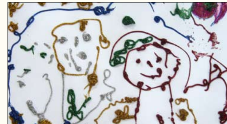
Lara Fares, 7 years old