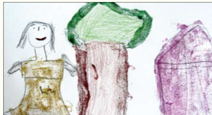
Rahaf Farid, 9